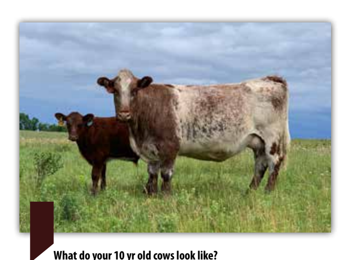
Lot 44 - 213G and dam.