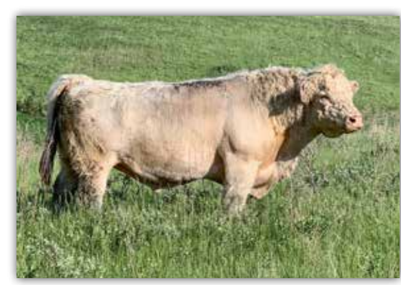
JDMC Big Sky 15X Sire of lots 2-8, 10, 18, 45-49, 61