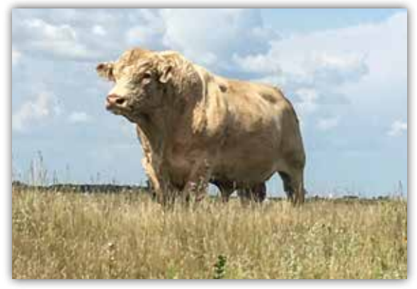
Muridale Dumbledore 109Z Sire of lots 73-75,78-79

The best set of Durham Blues we have ever offered, by a mile. Pounds heavy, powerfully constructed, with several half brothers in the group. Note their individual performance and excellent birth to weaning spread. These bulls have been a hit for our customers in the far west that run in high elevations. Why? They pass their PAP test in the spring and come home off the mountain in the fall having done their job. Great pen of bulls.