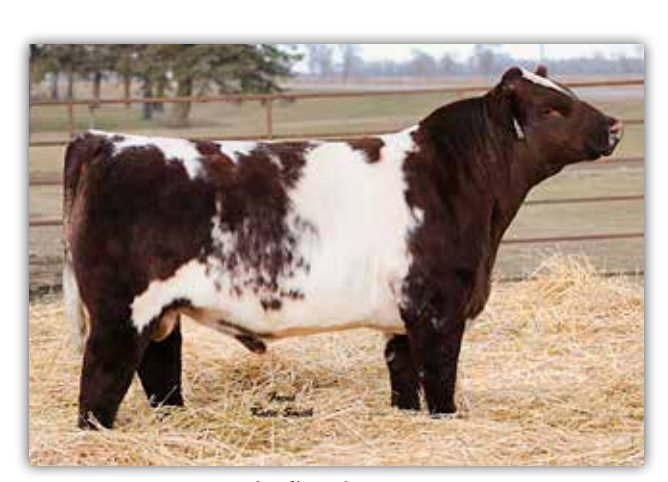
JSF/PVF Checkered Flag2 ET Sire of lots 53 & 54