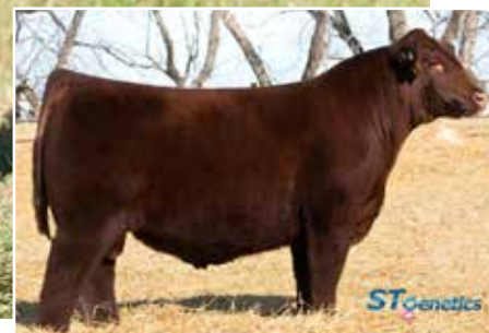
JSF Times Square 120G