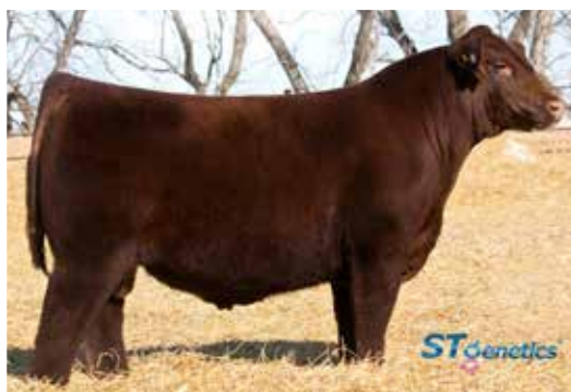
JSF Times Square 120G