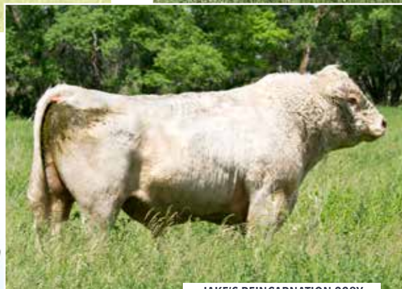
JAKE'S REINCARNATION 228Y