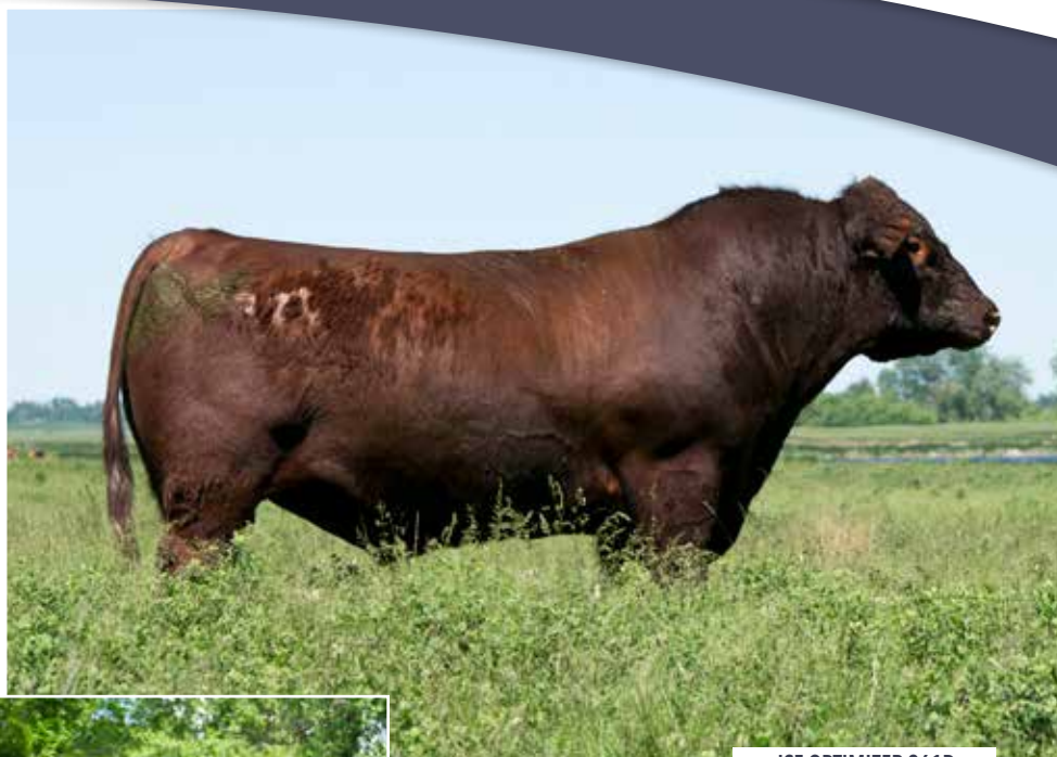
JSF OPTIMIZER 261D