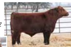
JSF Atlas 2Z