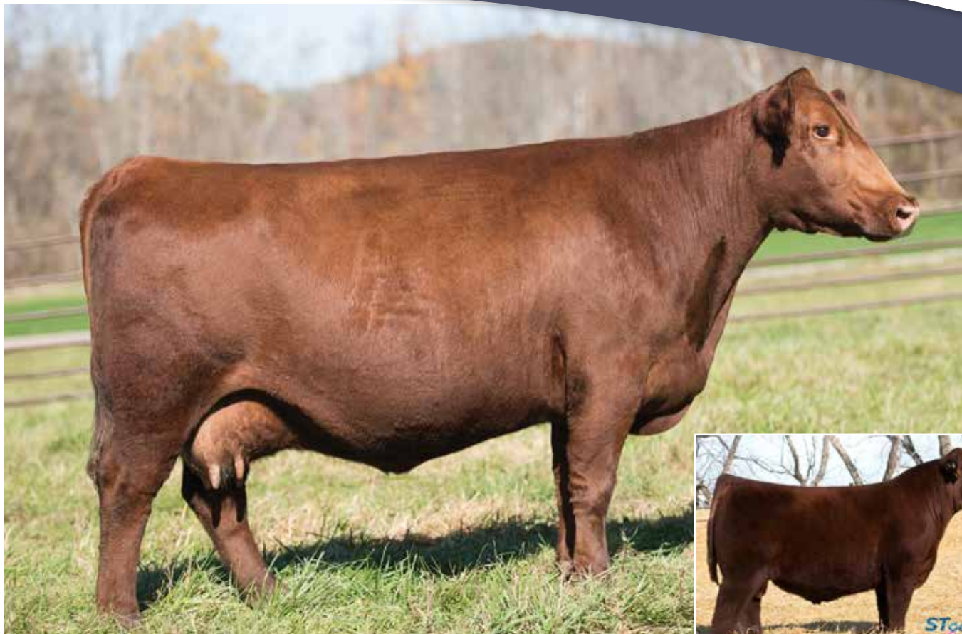
KL Gold Rose Progeny