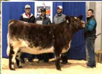
Lot 23 Dam