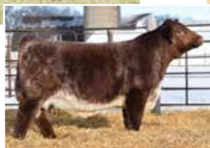
JSF Big Ticket 131D