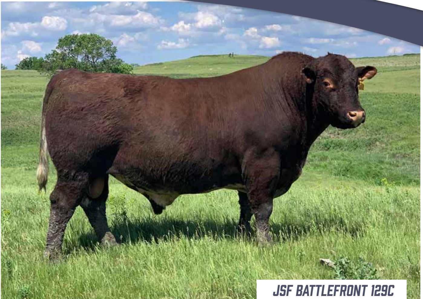
JSF BATTLEFRONT 129C