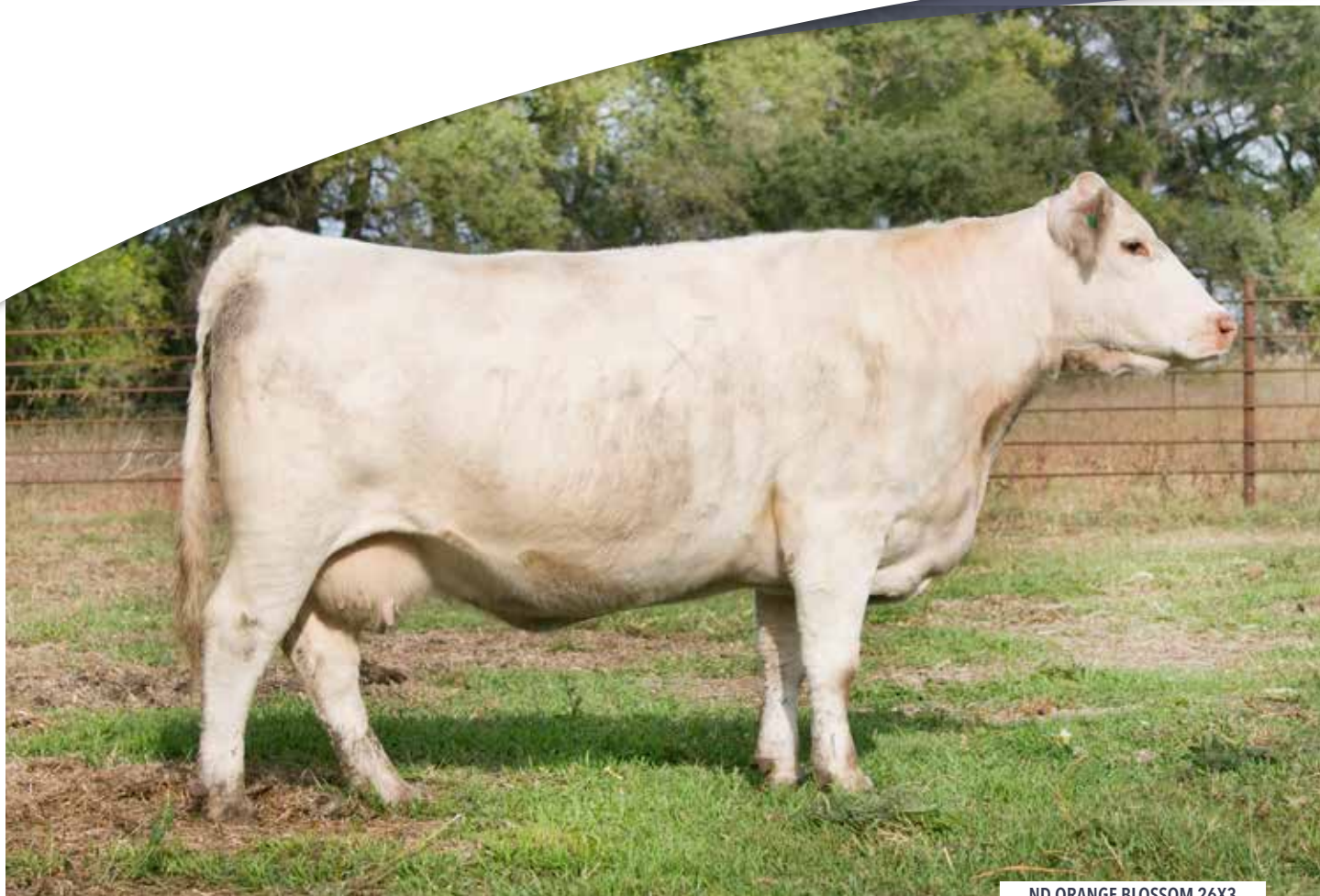
ND ORANGE BLOSSOM 26X3