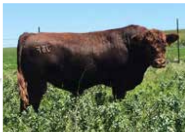
Red Rocket 89C