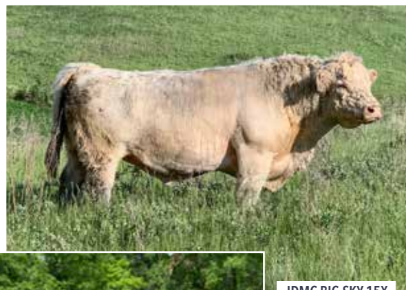
JDMC BIG SKY 15X