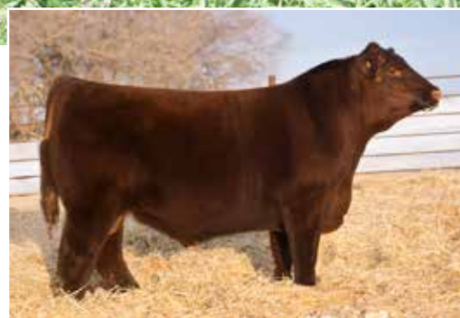
JSF Ember 209E

Sire of Lots 1E, 68, 76. Service Sire to Lots 74, 75, 77, 79-81.