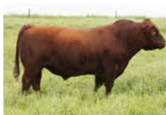
JSF Marquis 127x