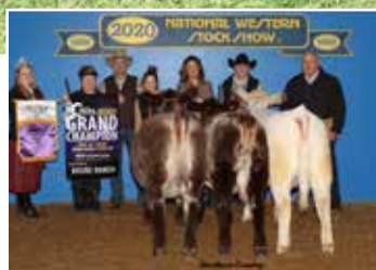
Grand Champion Pen of Three Shorthorn Heifers 2020 NWSS