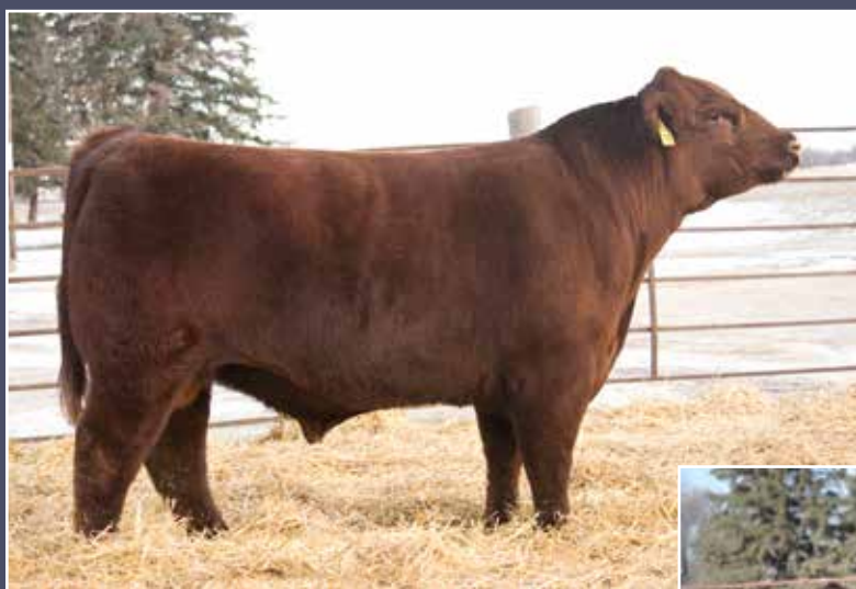
JSF Next in Line 273D