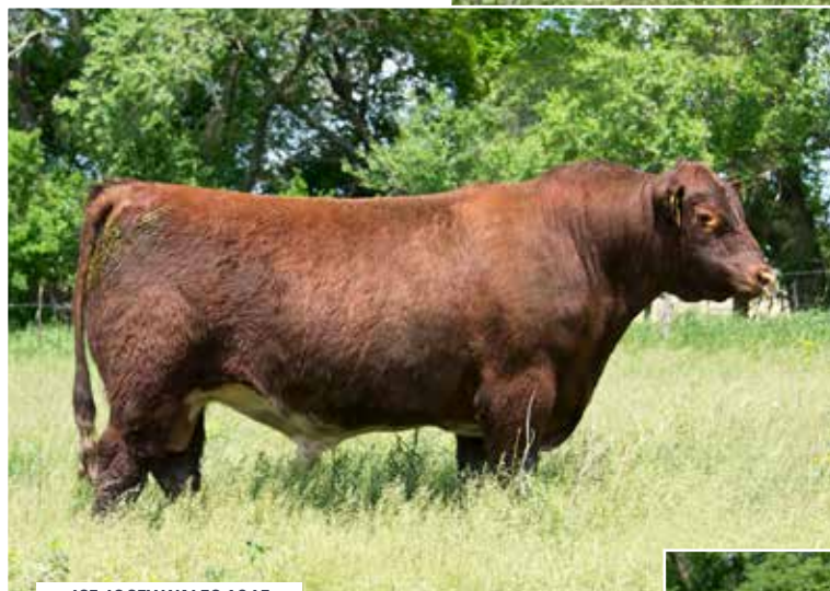
JSF JOSEY WALES 126E