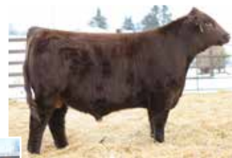
JSF Wall Street 106C