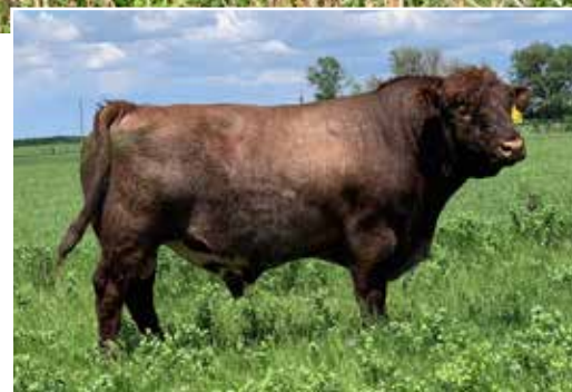
Bar N Ripper 99A

Sire of Lots 12A, 25, 65, 66. Service Sire to Lots 59-63, 68-71.