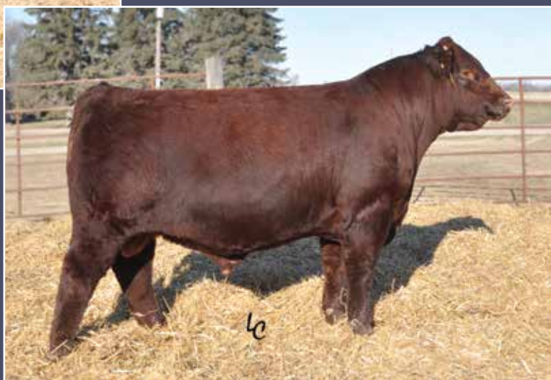
JSF Shear Force 165X