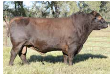
JSF Goldenrod 57U