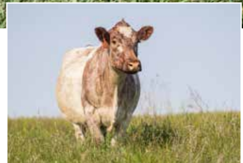
Dam - JSF Bella Thorne 102G