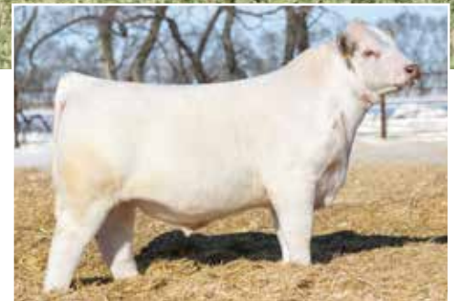
JSF Springsteen 183K ET Sire of Lot 2B Embryos