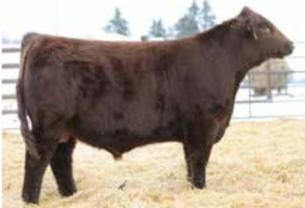
JSF Wallstreet 106C