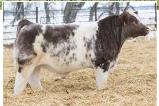
JSF Joe Cool 17K Service Sire of Lots 102-112, 114-116, 118-122