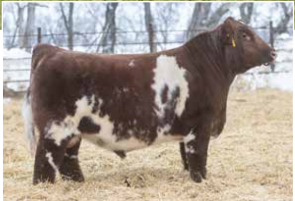
JSF Mendoza 134K Service Sire of Lots 2E, 81, 86, 88, 89-92, 96