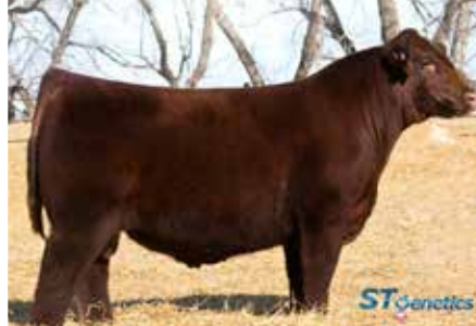
JSFTimes Square 120G