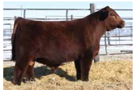
JSF Nasdaq 191D