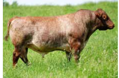
JSF Big Ticket 131D