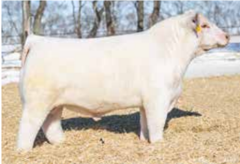
JSF White Noise 42K Service Sire of Lots 2D, 3B, 8A, 80, 82-84, 95

LOT 82 JSF ADELAIDE 115K *X4339441 | C | 3/10/2022 | RED | POLLED | JSF 115K