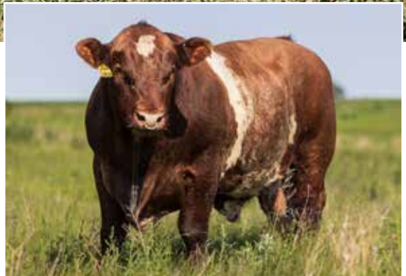
Byland Cash 1R086 Sire of Lots 5,5A,7,19,20