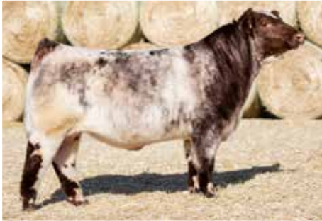
Byland Elite 2SD66 Service Sire of Lots 74, 76, 77, 78