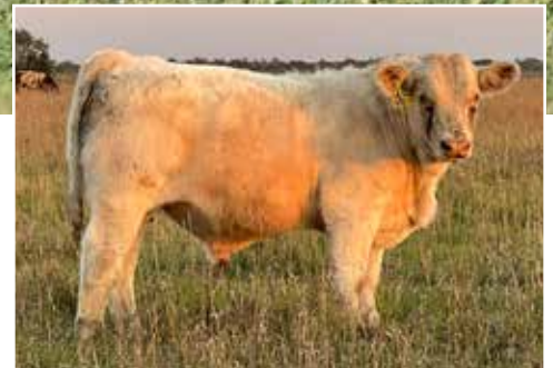
JSF Pegasus 189L ET