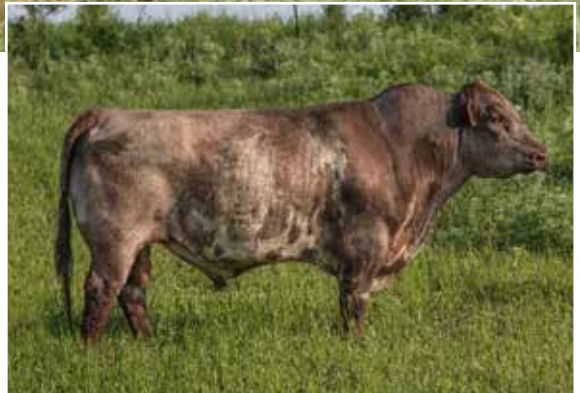
Deerhorn Durango 903G Sire of Lots 3, 4A, 8, 9A, 12, 16-18