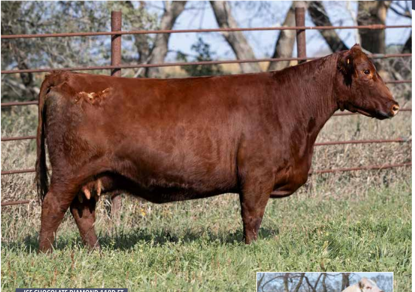
JSF CHOCOLATE DIAMOND 118D ET