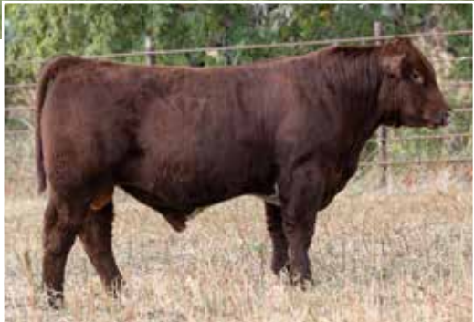
Maternal Sib Sold in Durham Nation 2022