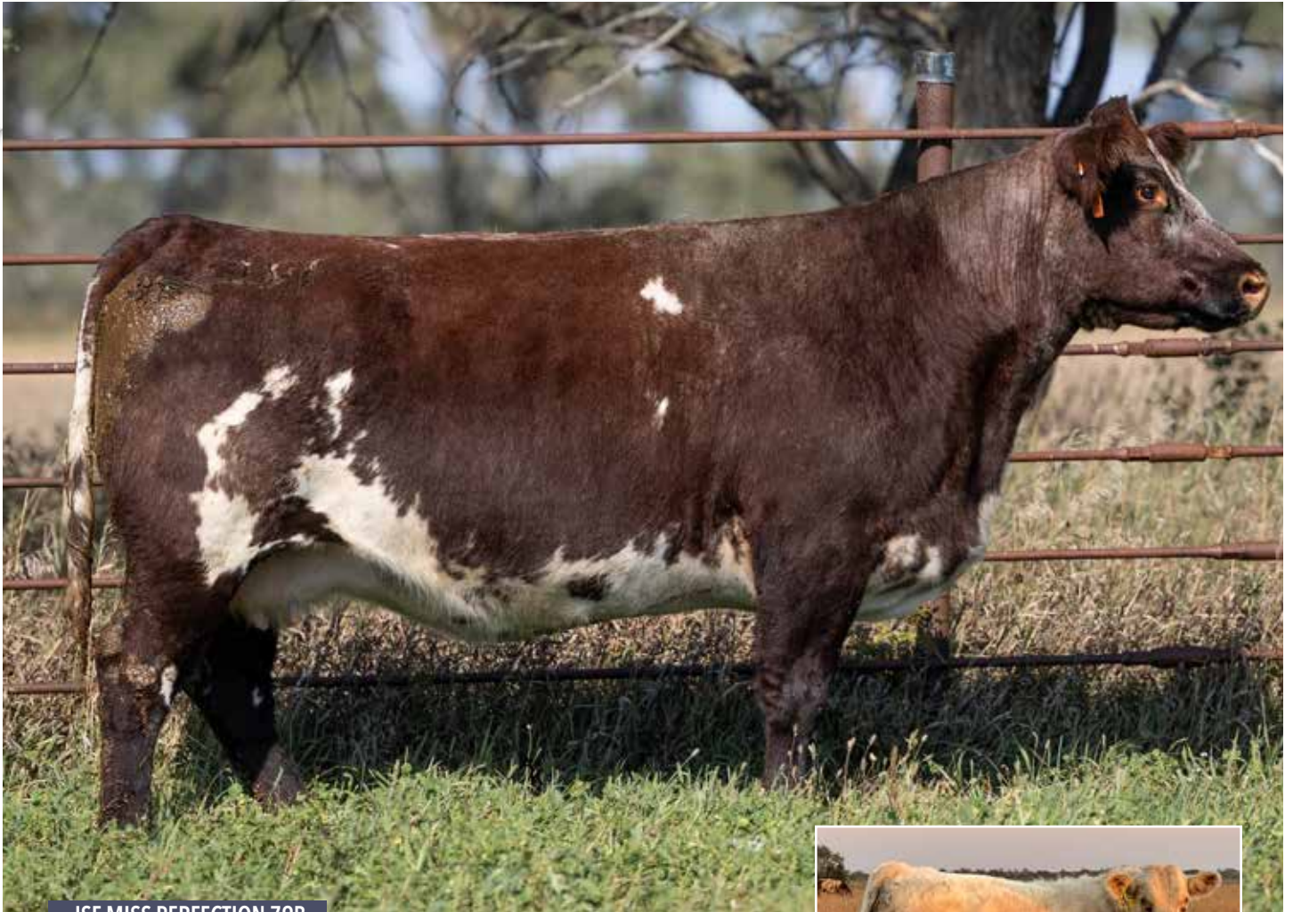
JSF MISS PERFECTION 79B