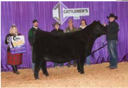
Dam of Lot 33