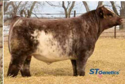
JSF Ronan 5H Service Sire of Lots 25, 26